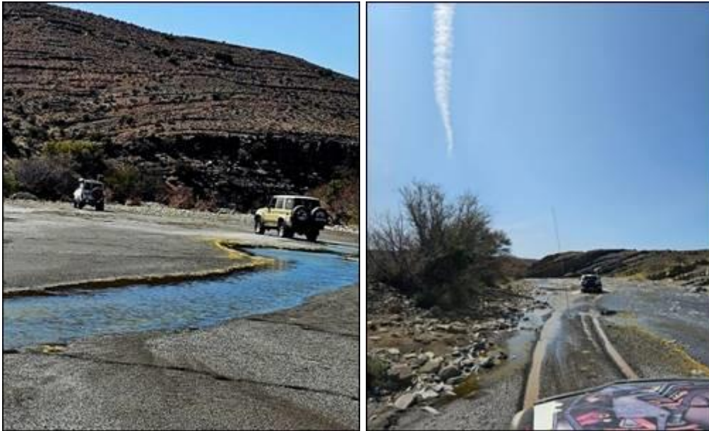
The whole time we were in and out of the river, thick sand, rocks, water, just unbelievably fantastic as you do not get this offering anywhere else.