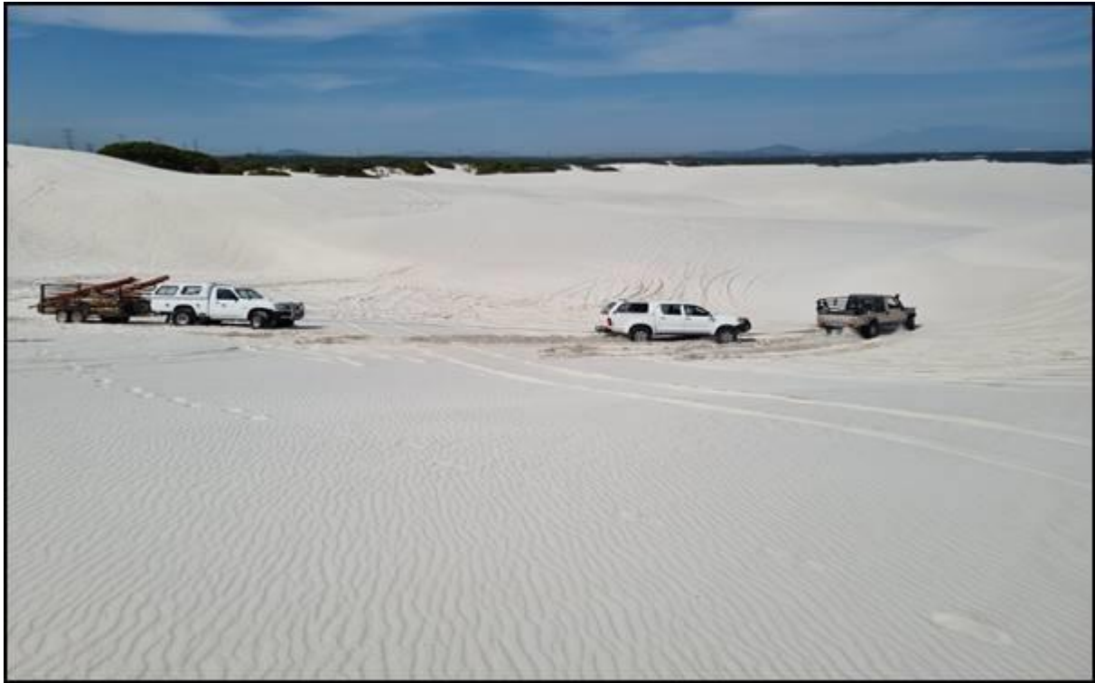
We battled with the tent trailer as we needed to put 3 vehicles in tandem to get it through the dunes - all part of the fun