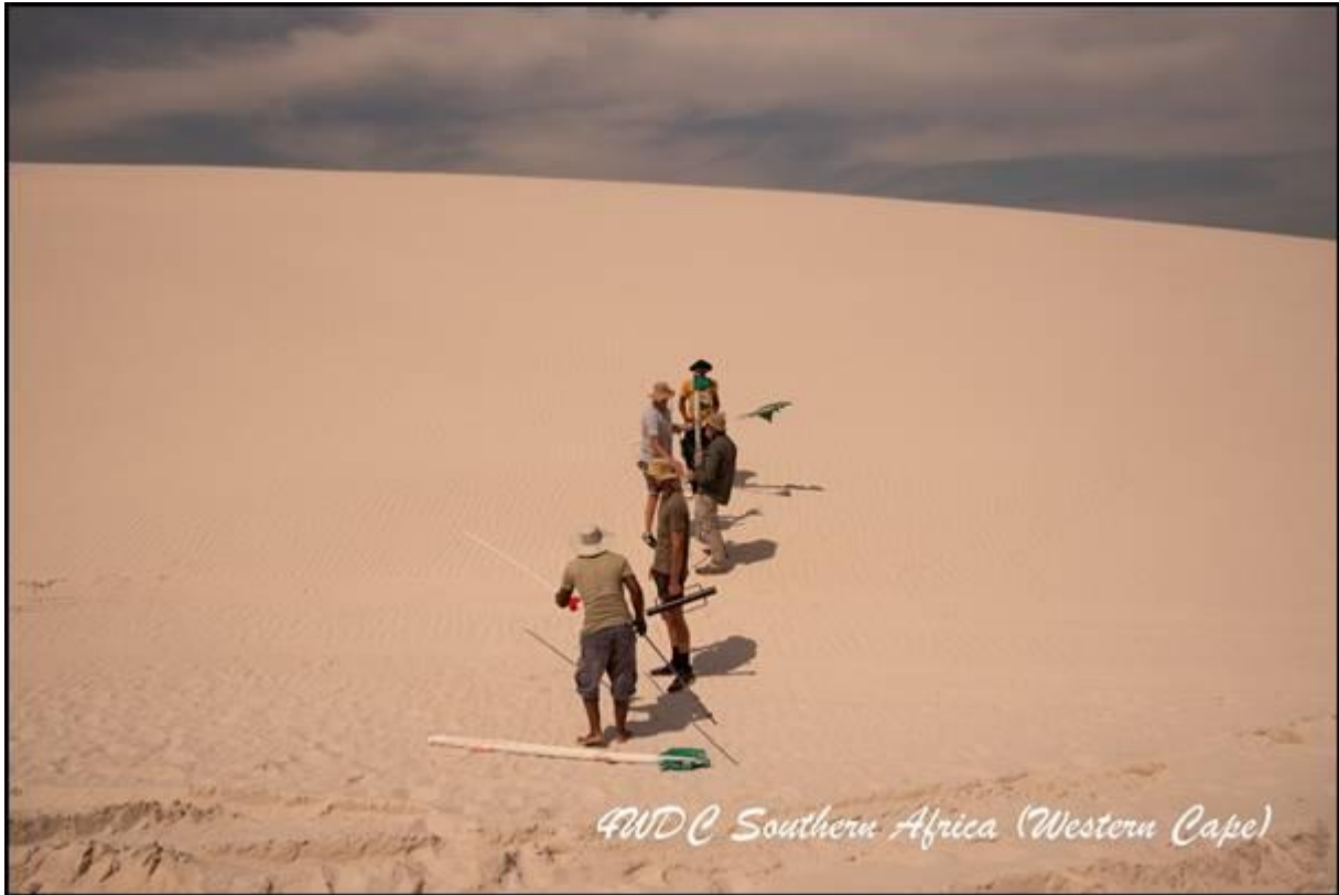
Our members and helpers in action, it took a huge team effort to build all the obstacles