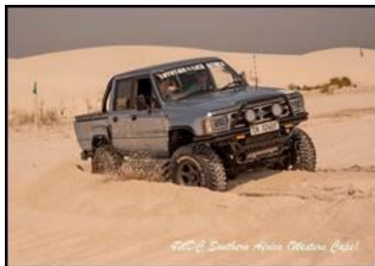
Age is just number and these to old gentleman still had it in them

Some cars wheels came off the rim as the tyres were deflated to low and while taking sharp turns - the wheels that were already hot and at a low pressure lost all pressure. The rule was that contestants had to recover themselves. Our recovery team (led by Johan Tyers) only assisted the Toyota teams.