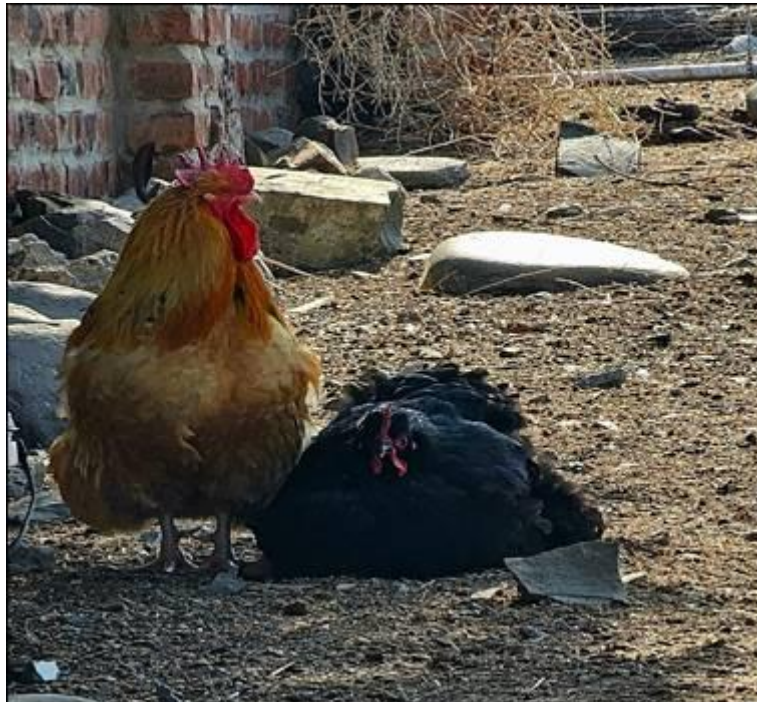
These farm chickens were huge, we had not seen anything like them before.

We left early as we had a long way back home and we expected the road to be very busy with kilometres of roadworks.