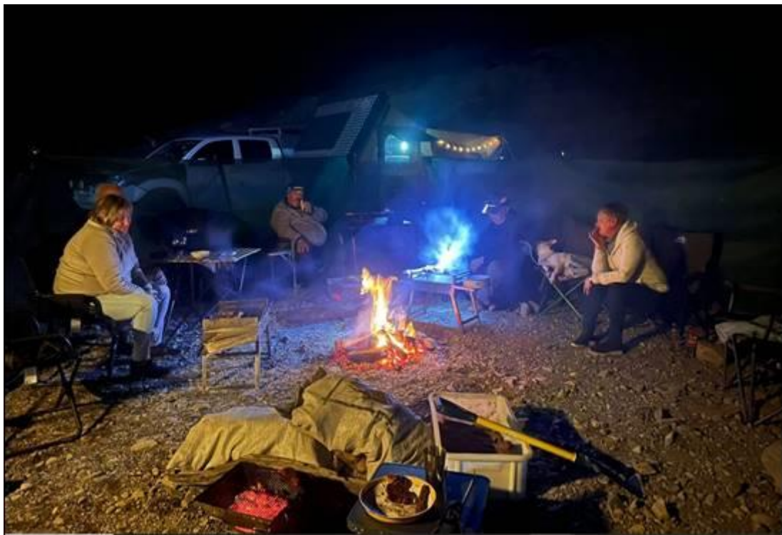
Every evening, we braaied together and shared many interesting stories of our lives while getting to know each other better.

On Saturday we took on the 27 km trail. At first it was a two-spoor track through the mountains. Eventually we came to a point where we entered the river and started following a very special trail, as the river wound through the farm making its way towards our camp with some amazing scenery.