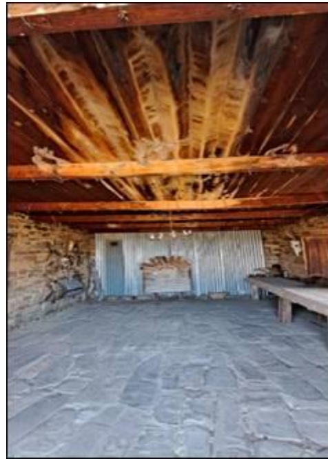
We slowly made our way back to the camp and stopped at "Die Klipstoor" to find out what it was all about.