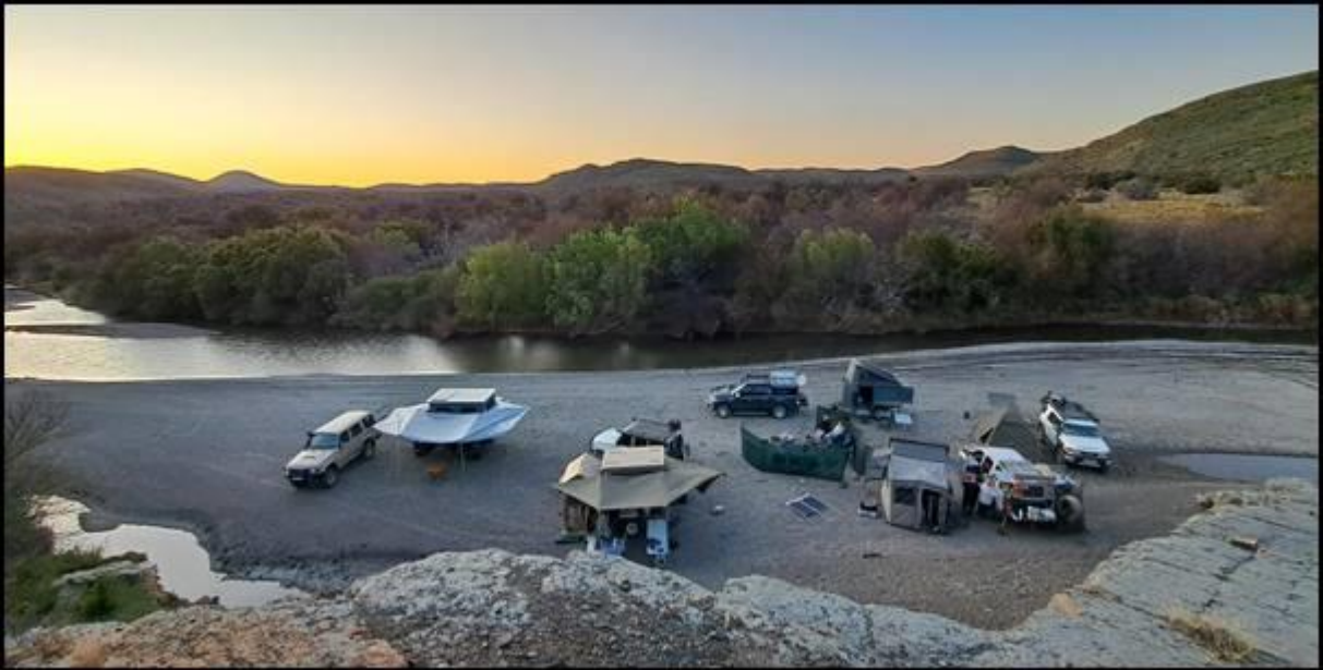
We set up camp in the most amazing spot. How fortunate, we were able to camp in the wild and enjoy the things we love with likeminded people.