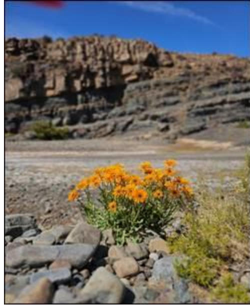
We stopped somewhere on the trail next to a rock bank and had brunch there while taking in the beauty of the environment.