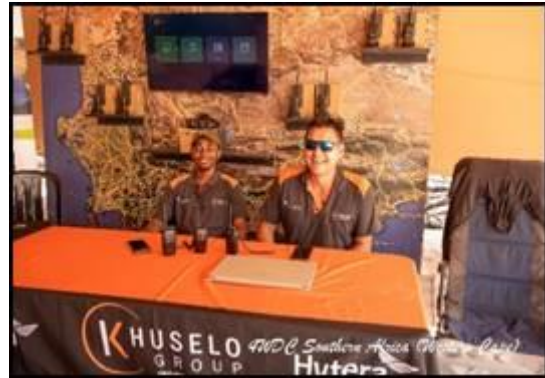
We also had static displays, all offroad related