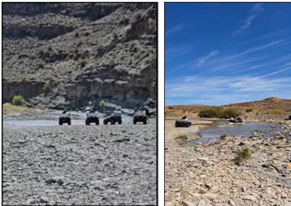
We met a guided quad bike group which is an option to do on the farm, and it looked like a lot of fun.