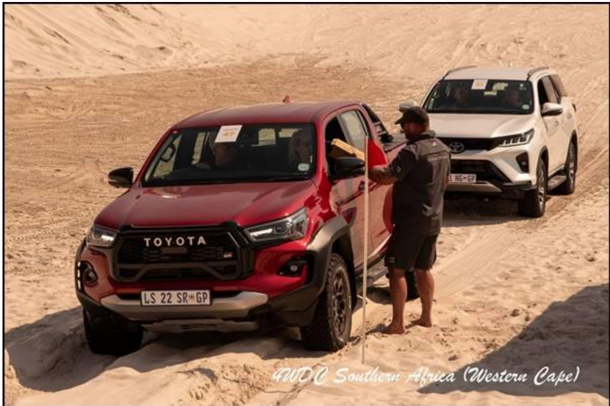
Team Toyota start their challenge